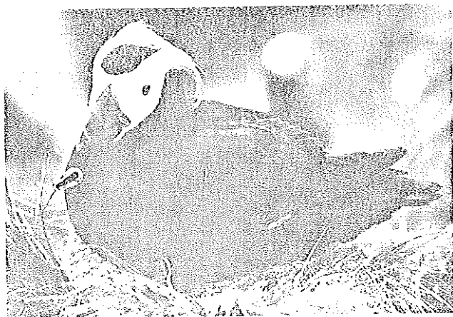
Adult puffin sitting on guard outside puffin burrow.

out the next morning, but ten minutes more and we met many of the fishing fleet coming in. We turned back. If it was too rough to fish, it was certainly too rough to negotiate Cape Cook, whose weather was about the worst in North America.