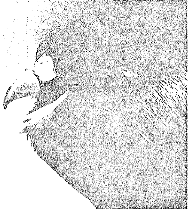
Immature puffin still wearing crown of down.

Digging out the chicks was relatively easy, but the big problem would be capturing adults quickly. They do not brood at the advanced stage the chicks had reached, and after timing feeding visits, we found that adults stay in the burrows from four to 37 seconds. Scrambling up a 200 foot, 70 degree bluff in even 37 seconds might be exciting but