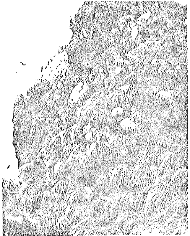
Puffin Colony — puffin nests are placed in burrows extending 3-10 feet underground.

This was a heavy blow. The puffins' chance of survival would be less if they had to stay cooped up a whole day. I must have looked as stricken as