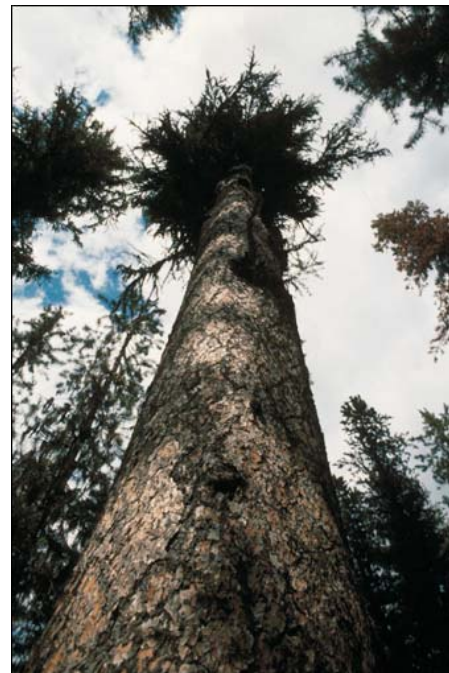
Old growth larch in Gilnockie Creek ER