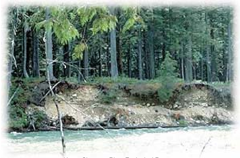
Upper Shuswap River Ecological Reserve