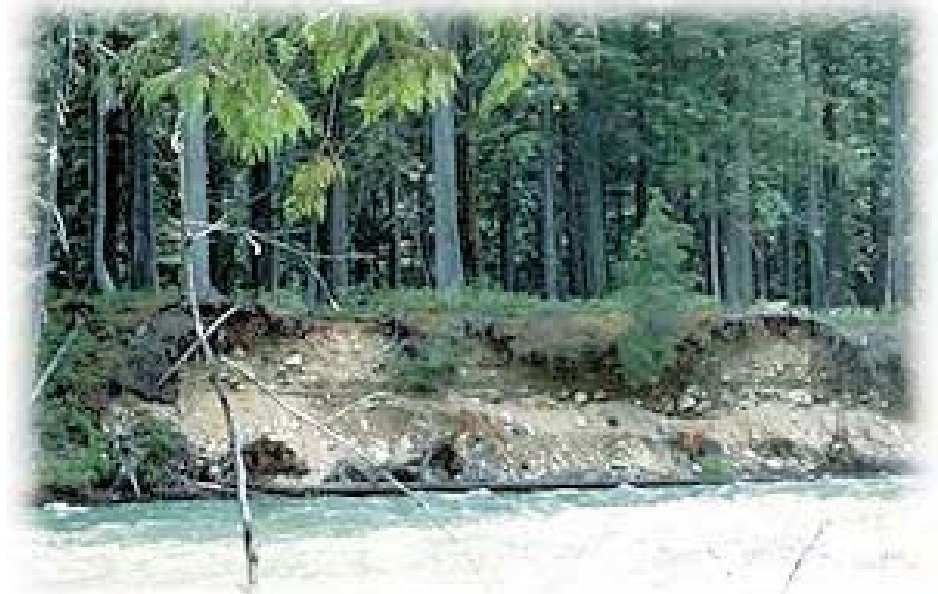
Upper Shuswap River Ecological Reserve