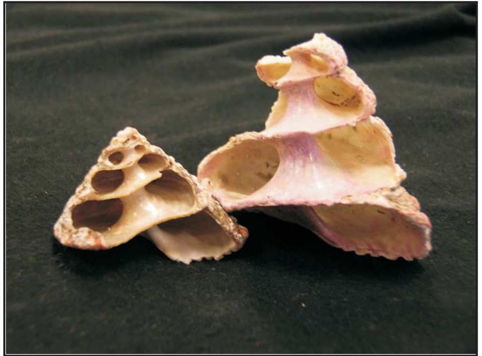
Figure 2: These snails have been broken perpendicular to the base. We believe that they were eaten by sea otters.

In the meantime, the Canadian sea otter population is growing. Our annual counts indicate that the sea otter population in and around Checleset Bay Ecological Reserve has been stable since about 1995; having reached a carrying capacity that is probably determined by prey abundance. Overall however, the BC otter population continues to expand