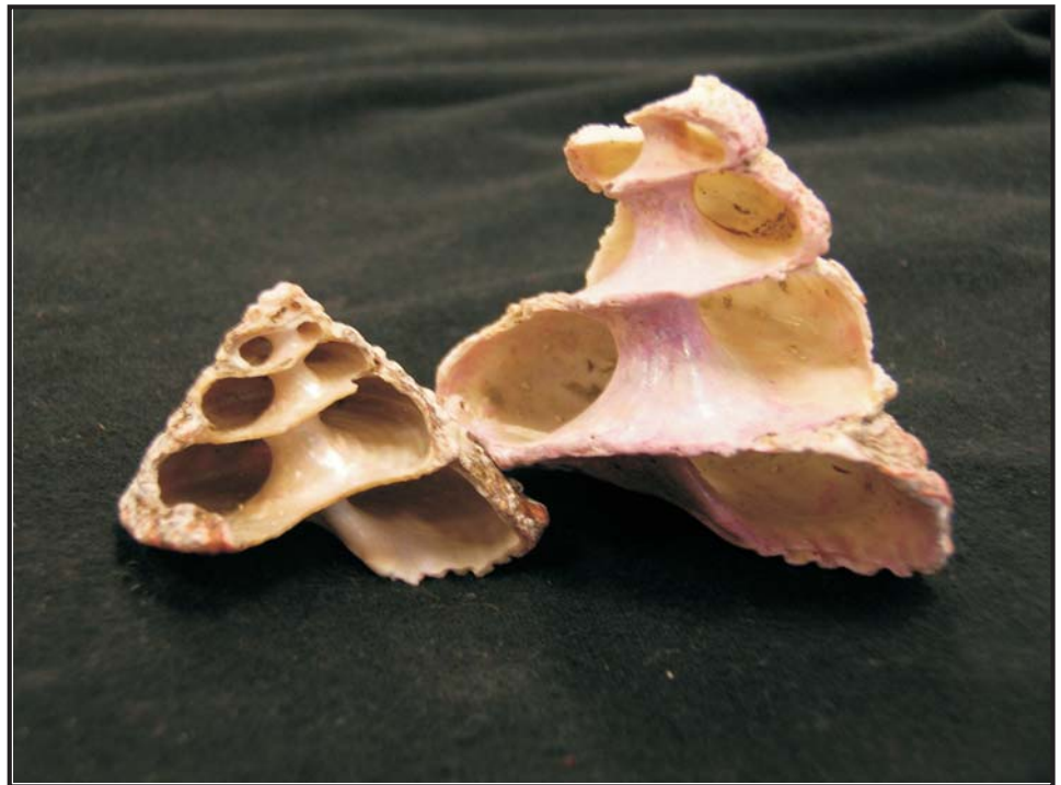
Figure 2: These snails have been broken perpendicular to the base. We believe that they were eaten by sea otters.

In the meantime, the Canadian sea otter population is growing. Our annual counts indicate that the sea otter population in and around Checleset Bay Ecological Reserve has been stable since about 1995; having reached a carrying capacity that is probably determined by prey abundance. Overall however, the BC otter population continues to expand