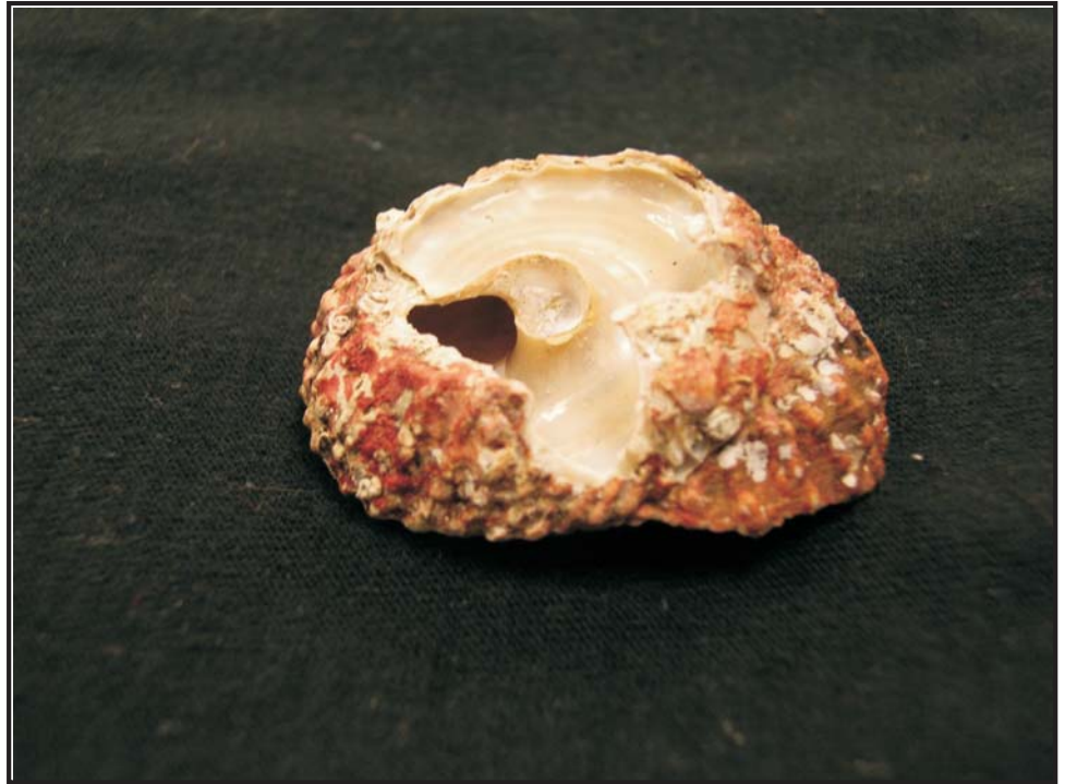
Figure 1: Snail A, which has been broken parallel to the base has been eaten by a crab.

In fact in areas without sea otters, we think red turban snails are most likely to get eaten when they are small – being preyed upon by a variety of invertebrate predators, especially crabs. We compared the source of mortality in snails in areas with (Checleset Bay) and without (Barkley Sound) sea