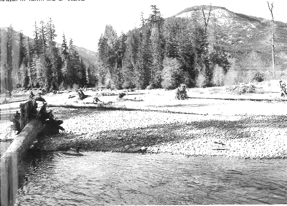
SH AT NORTH END OF ISLAND