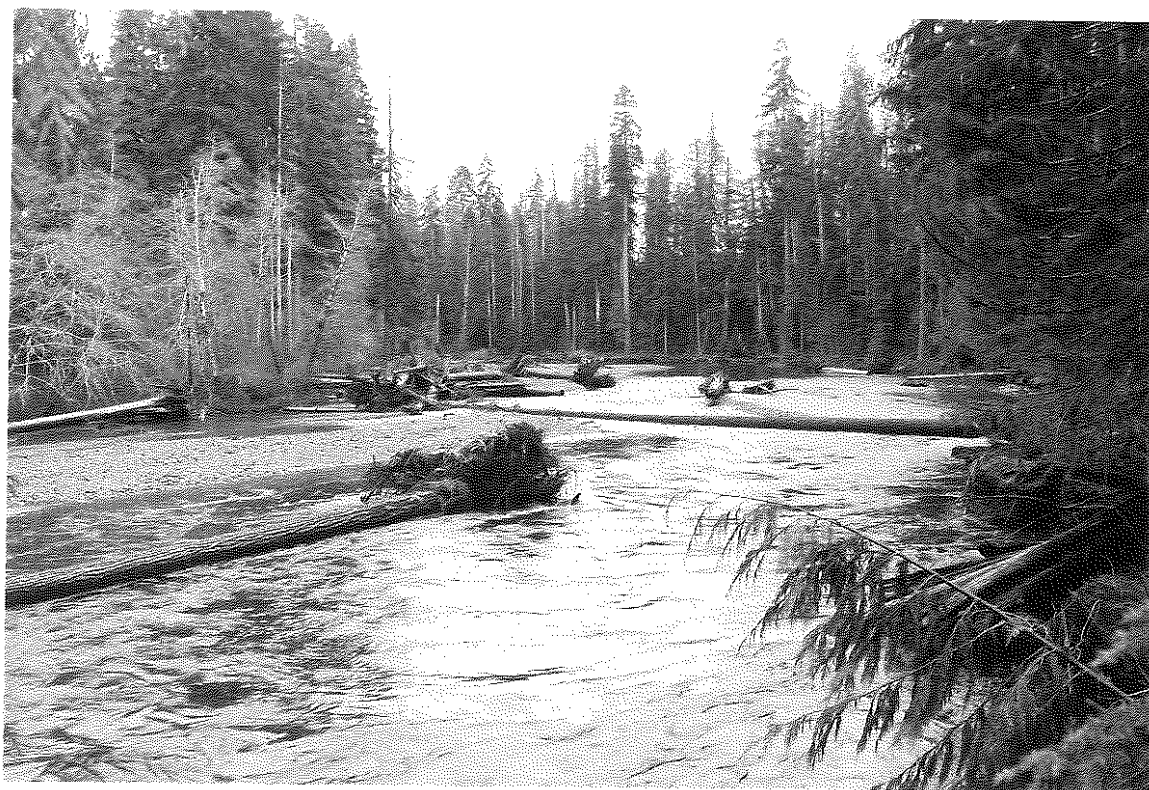
PHOTO 6: LOOKING UPSTREAM ALONG WEST SIDE OF ISLAND. NOTE LOG DEBRIS