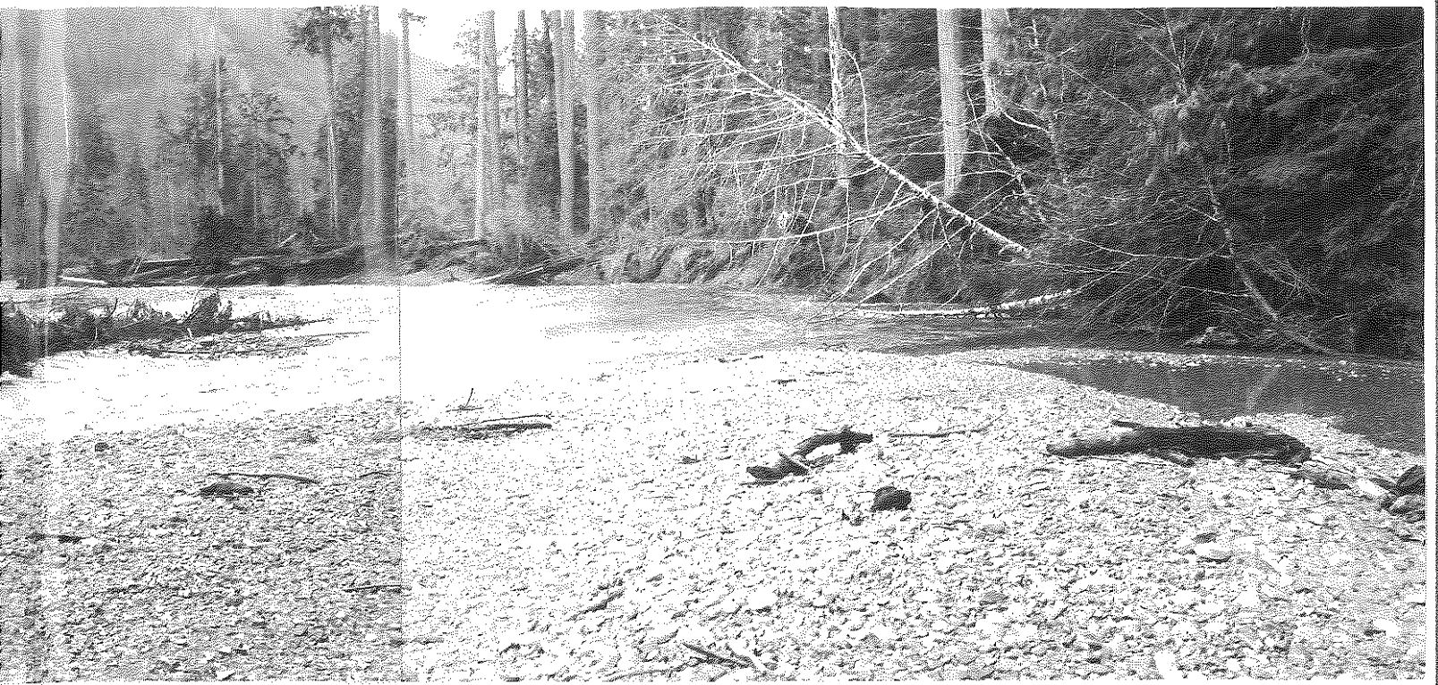
MPKISH AT NORTH END OF ISLAND