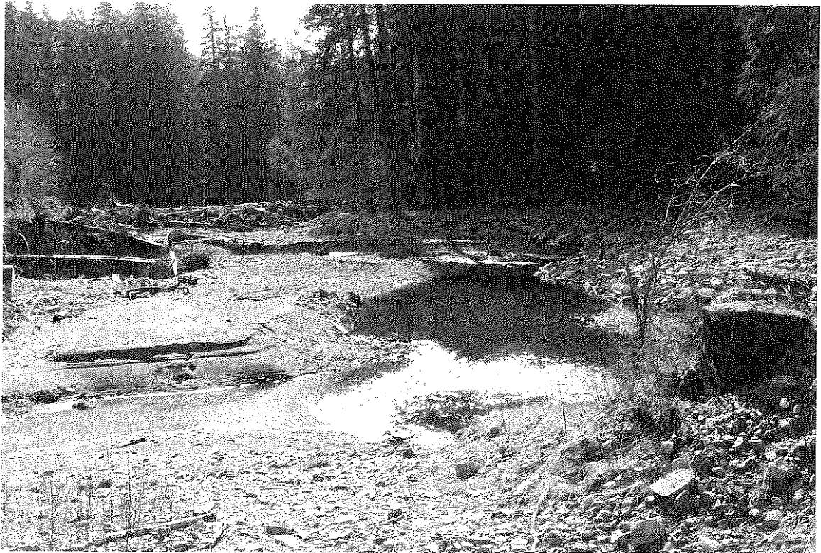
PHOTO 8: MAIN CUTOFF CHANNEL, LOOKING SOUTH ACROSS RIPRAP AND 1987 BERM