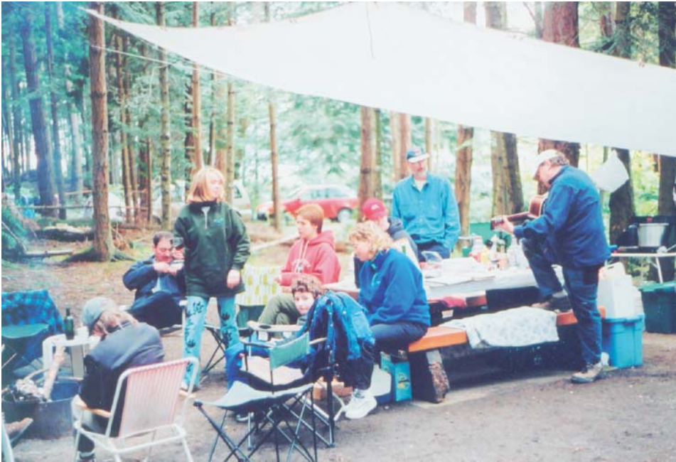
Families enjoying Montague Harbour Provincial Park, Galiano Island

entrepreneurial expertise and environmental best practices through investments in park infrastructure replacements and improvements.