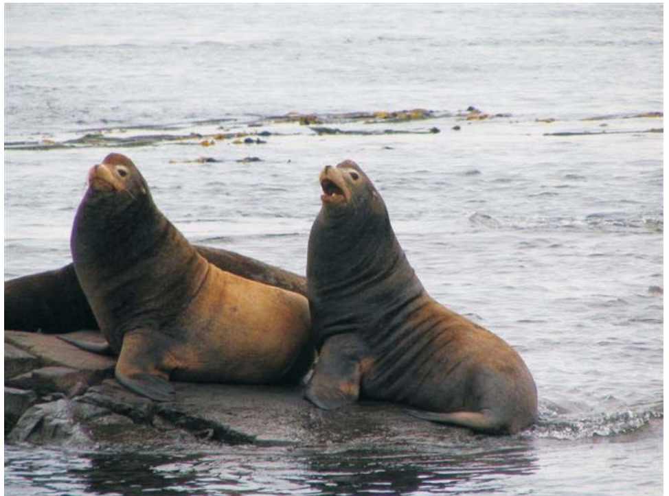
California Sea Lions Greeting Race Rocks ER Tour Participants

The drive to Pearson College, our jump-off destination to Race Rocks, was a long one, but it gave me time to wake up. The other passengers in the car talked idly, the usual prattle. After a brief stint of being uncertain as to where exactly we were supposed to be (and even consulting an oh-so handy campus map that we passed), we joined the assembly of fourteen or so and off we went to get our life jackets. I was surprised and happy to see that the group was spread across the age spectrum – from kids to teenagers to adults – all camps were there. The Pearson College students stared at us as we went by – I suppose they weren't expecting to see a group of trussed-up people walking past so early. Their breakfast smelled very, very nice, not to mention warm.