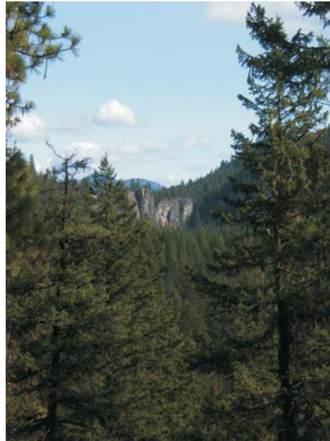
Cliffs near north end of Cougar Canyon ER

youth and nature, community involvement and leveraging the 2011 Park Centenary.