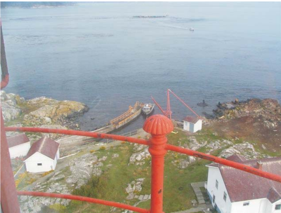
View from the top of the lighthouse at Race Rocks

On Monday, back at school, it was hard to explain the trip to our friends. It didn't sound all that exciting to them, really. I begged to differ, but let them think that. Even if it doesn't sound like your typical nature outing, I enjoyed it thoroughly, and it was a lovely experience I don't ever think I could recreate. Though, I think I could do without the smell.