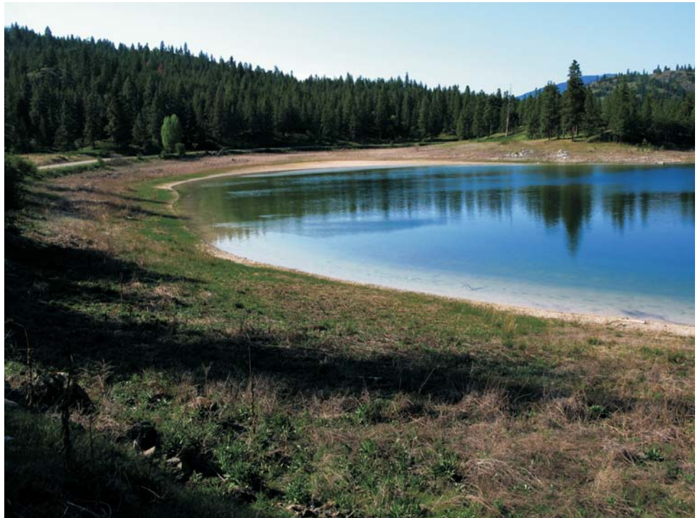
Lower winter water levels at Mahoney Lake ER

and the chances to establish new ecological reserves with natural boundaries are getting more remote. Will we