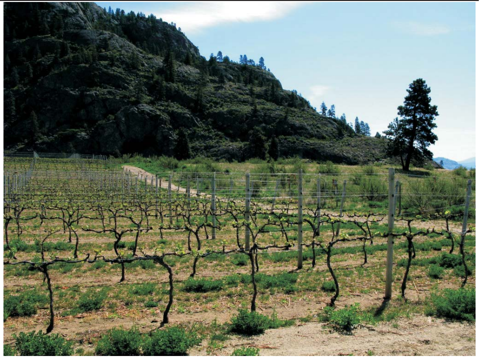
Narrow field road divides the Haynes' Lease ER from the Borrowing Owl Winery

I also like the broader flexibility of the Manitoba Ecological Reserves Act that does not restrict the creation of ecological reserves on Crown land only. In British Columbia, the provincial governments over the years have happily given away Crown land without any ecological considerations,