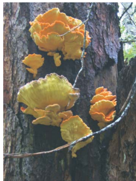
Fungi on a tree near Vance Creek